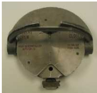
Original Airbus Style